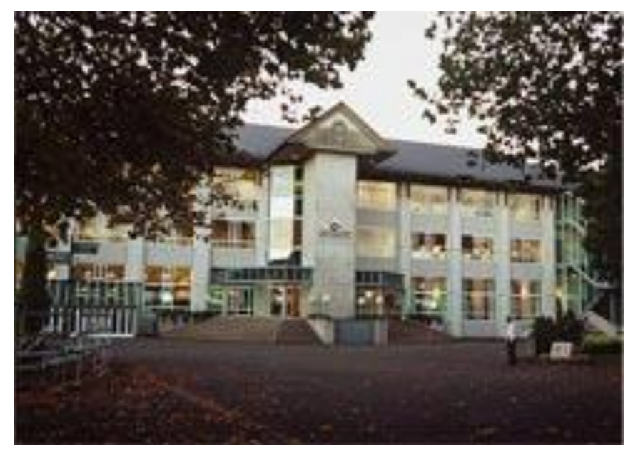
Fig 3: Venue