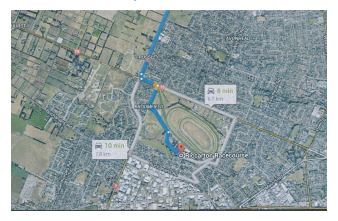
Fig 1 Venue location

Riccarton Park Function Centre 165 Racecourse Road, Upper Riccarton, New Zealand Phone: +64 3 3360055 Website: www.riccartonpark.co.nz